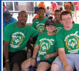
receiving services for 5 yrs