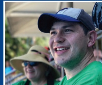
receiving services for 29 yrs