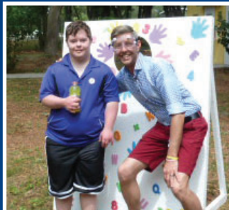
on waiting list for 7 yrs