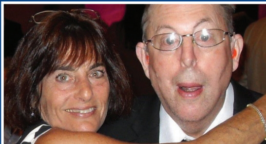
receiving services for over 30 yrs