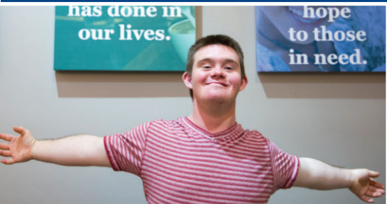
receiving services for 7 yrs

Family Care Council Florida P.O. Box 300100 Fern Park, FL 32730-0100