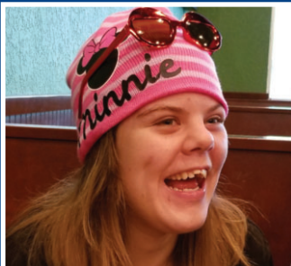
receiving services for 9 yrs